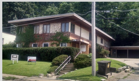
1718 8th Avenue Moline, IL 61265