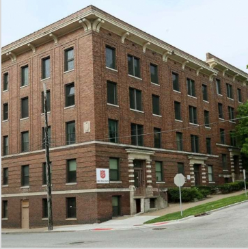
307 W 6th Street Davenport, IA 52803