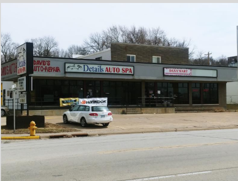
4401 11th Street Rock Island, IL 61201