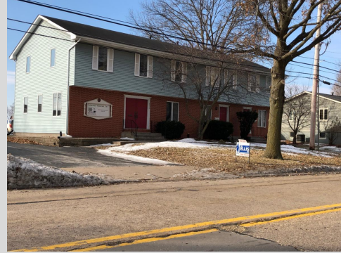
2314 31st Avenue Rock Island, IL 61201