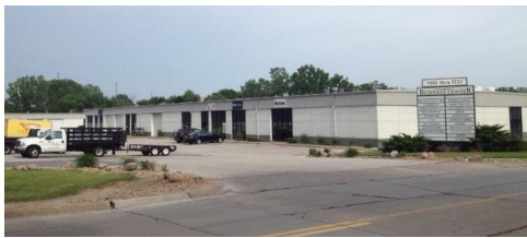
5100 Tremont Avenue Unit 5111B Davenport, IA 52807