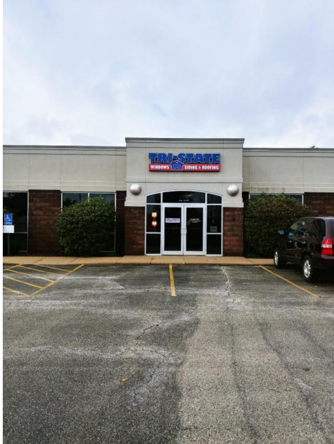
5216 Sheridan Street Davenport, IA 52806