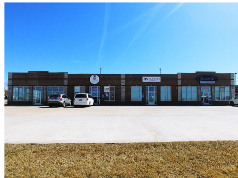
5345 Belle Avenue Davenport, IA 52807