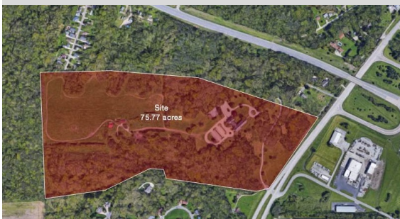
4760 & 4802 Rockingham Road Davenport, IA 52802