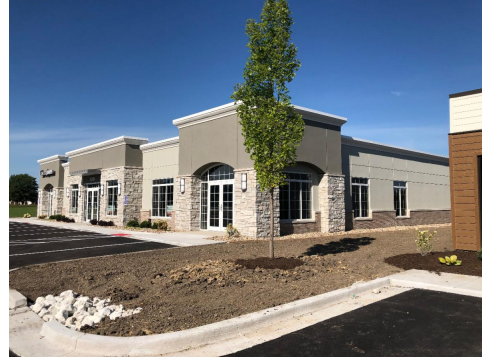
5701 Utica Ridge Road Davenport, IA 52807