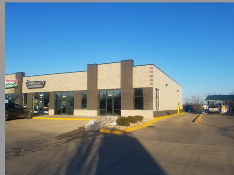
3203 Devils Glen Road Bettendorf, IA 52722