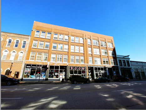
226 - 228 W 3rd Street Davenport, IA 52801