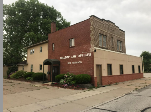
1313 Harrison Street Davenport, IA 52803