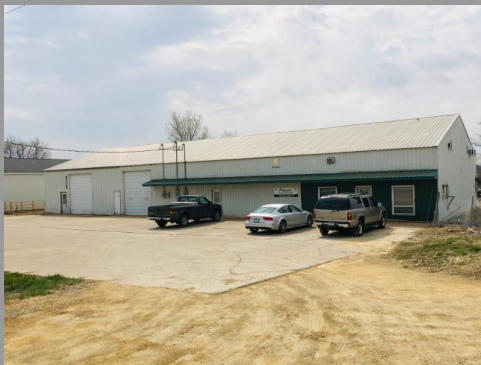
1631 Main Street Clinton, IA 52732