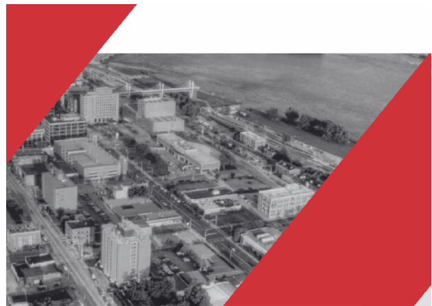
Quad Cities Region Iowa & Illinois

Thank you to all of our sponsors for their support of the event. They help make this event possible.