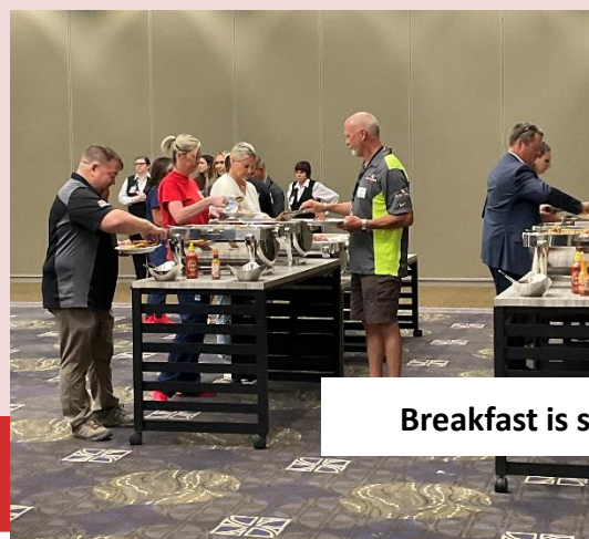
Breakfast is served!!