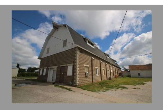
3901 Hickory Grove Road Davenport, IA 52806