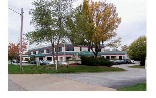
5000 Tremont Avenue Davenport, IA 52807