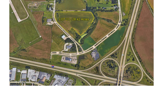
0 N Harrison Street Lot 21 Davenport, IA 52806