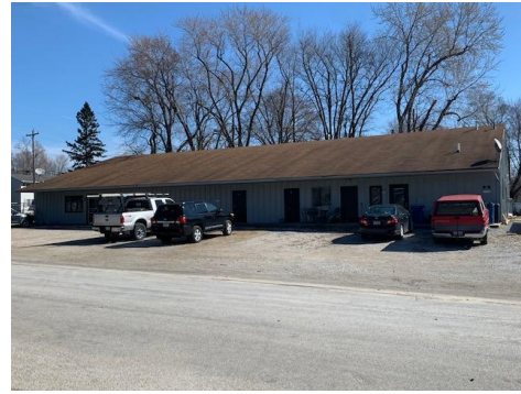
111 Oak Street Buffalo, IA 52728