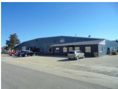
311 21st Street Camanche, IA 52730