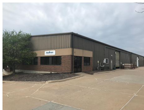
908 E 59th Street Davenport, IA 52807