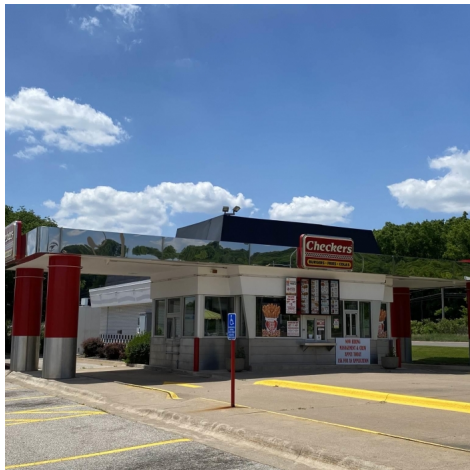
4010 Blackhawk Road Rock Island, IL 61201