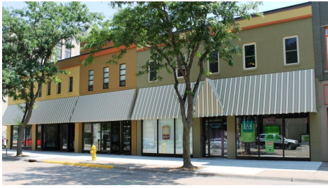
1610 2nd Avenue Rock Island, IL 61201