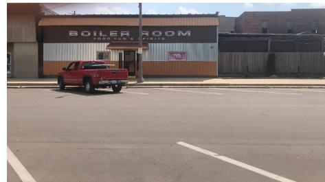
200 N Chestnut Street Kewanee, IL 61443