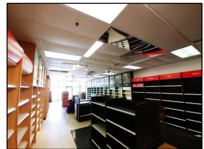
Suite 7 – 1,280 SF Available