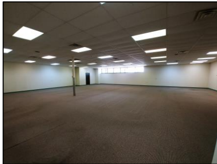
Suite 1 – 13,000 SF Available